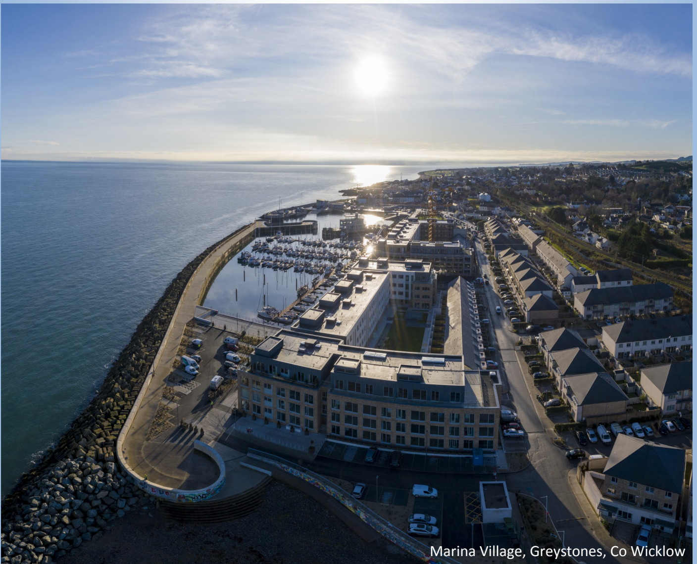
Marina Village, Greystones, Co Wicklow

Providing Turnkey Fire Stopping Services