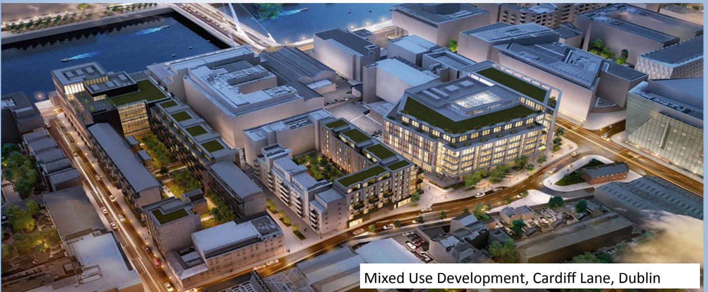
Mixed Use Development, Cardiff Lane, Dublin

We have a proven track record amongst our clients for working diligently, within budget and on time. Each project we undertake is tailored to suit our client's needs whether that's working within a live building, a refurb or a new build.