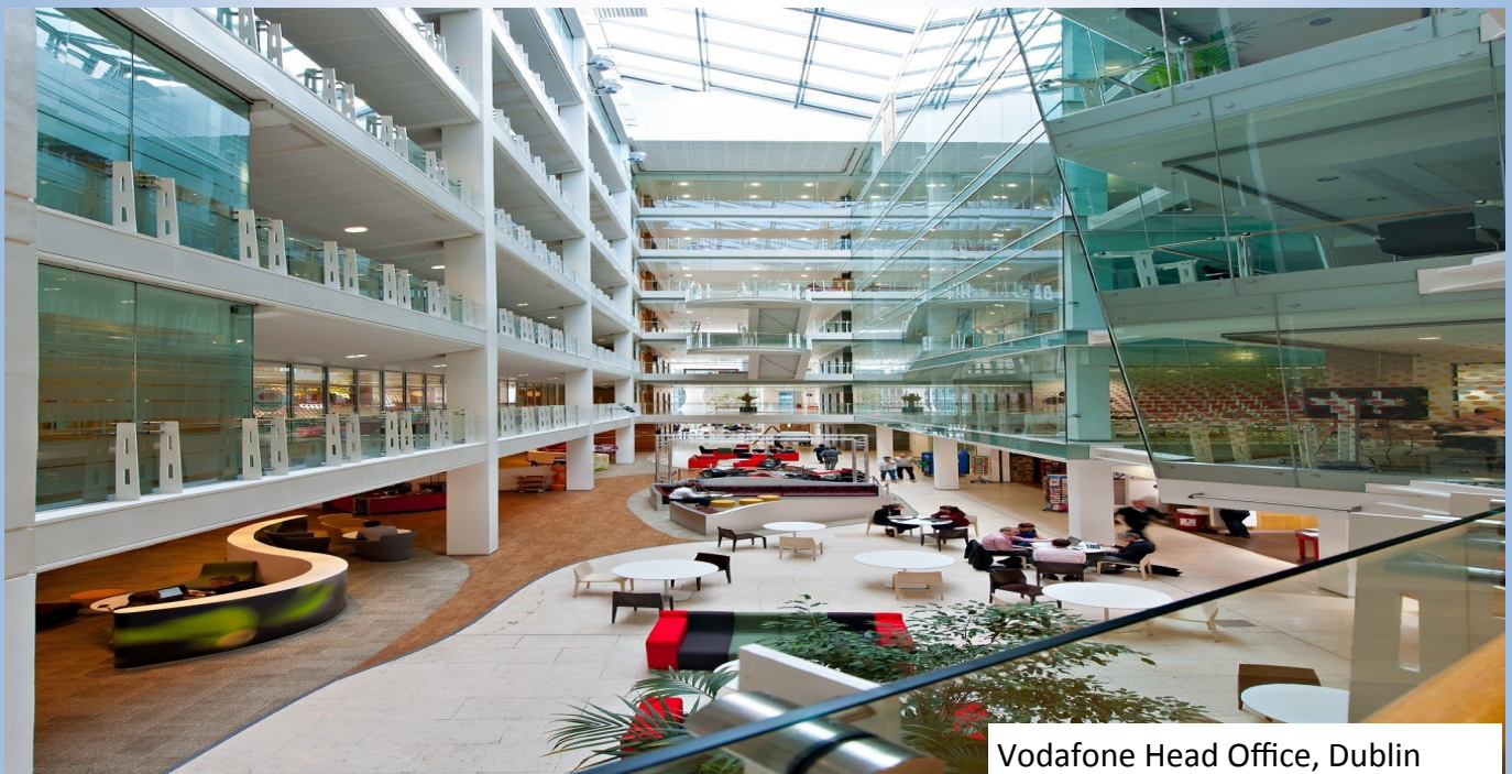
Vodafone Head Office, Dublin