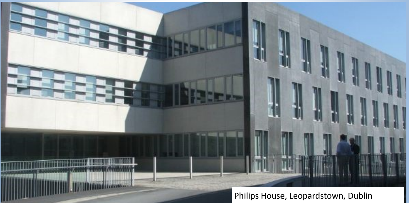
Philips House, Leopardstown, Dublin