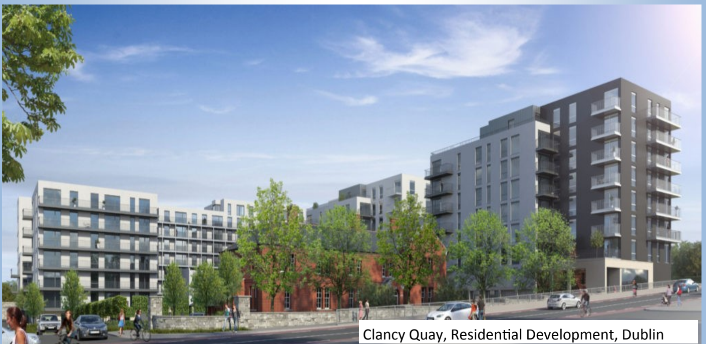
Clancy Quay, Residential Development, Dublin